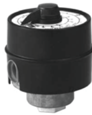
Model UH (Universal High) With Totalizer