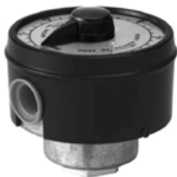
Model UL (Universal Low) No Totalizer

* Tested with Mobil DTE-25 motor oil. Flow rates vary with fluid viscosity.