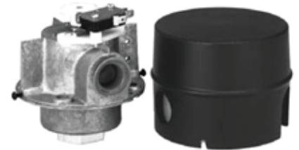
Model UP (Universal Pulse) With Switch Assembly